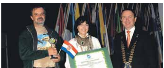
In the category of General Countryside: ECOTOURISM ON TRAMUNTANA (ISLAND OF CRES, CROATIA) AS A TOOL FOR THE PROTECTION OF NATURAL AND CULTURAL- HISTORICAL HERITAGE (Croatia) – www.supovi.hr