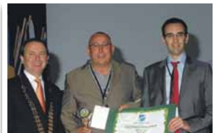
In the category of Transportation: BLUE STAR (France) – www.bluestar-foundation.org