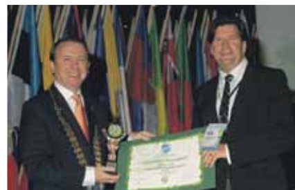
In the category of Educational Programmes & Media: UGANDA MOUNTAIN GORILLA PROJECT (Canada) – www.umanitoba.ca