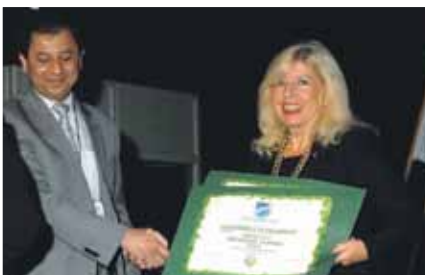
In the category of Urban Accommodation: WORLDWIDE 1st CITY HOTEL WITH A ZERO-ENERGY BALANCE (Austria) – www.hotelstadthalle.at