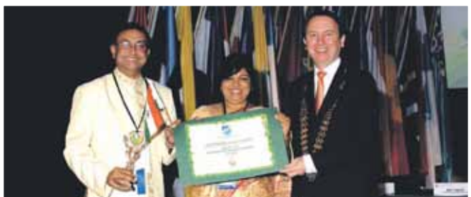
In the category of Rural Accommodation: OUR NATIVE VILLAGE (India) – www.ournativevillage.com