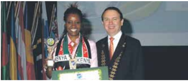
In the category of Tour Operators & Travel Agents: GAMEWATCHERS SAFARIS & PORINI SAFARI CAMPS (Kenya) – www.porini.com