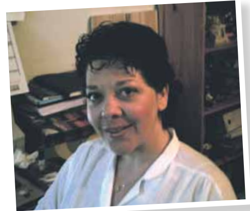
By Vitalina Le Feuvre Skål International Paris

I hope that these few lines are proof of a true “Skål spirit”, the amazing kindness and availability of Skålleagues wherever they are in the world. I want to thank them all and make it known that I am available to all Skålleagues if I can be of any help in Paris.