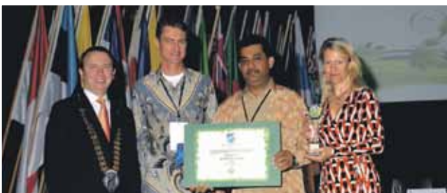
In the category of Cities & Villages: MUNTIGUNUNG DEVELOPMENT PROGRAM (Indonesia) – www.zukunft-fuer-kinder.ch/en